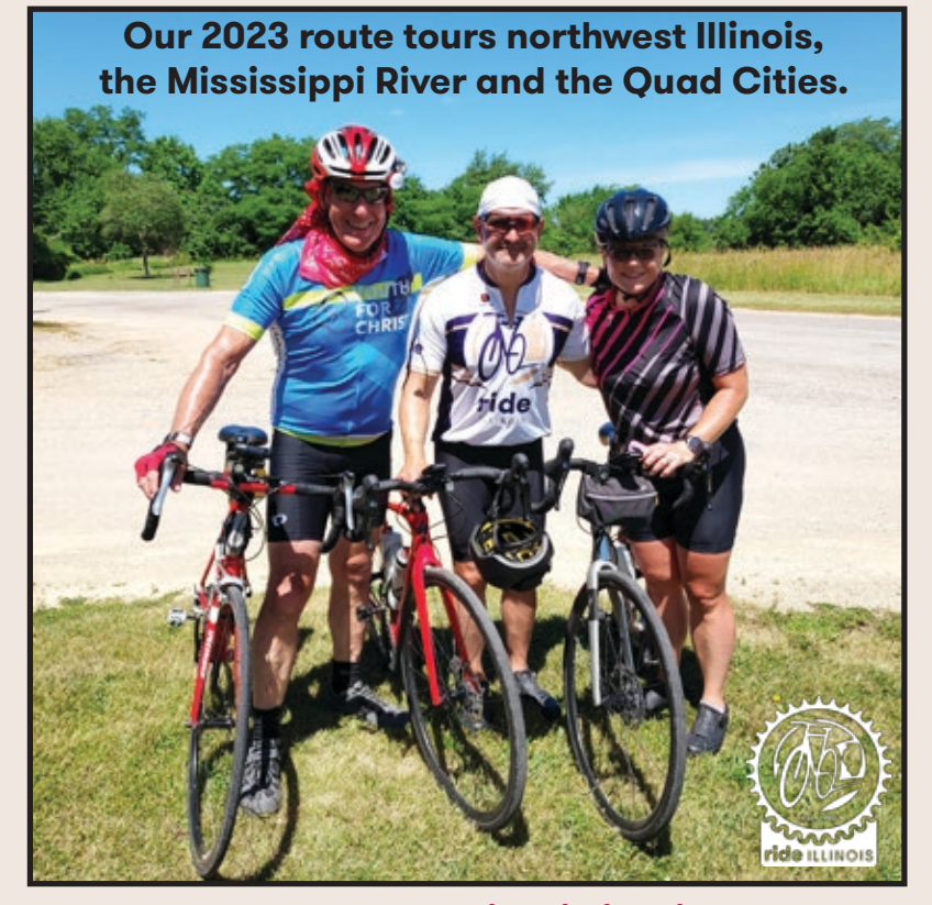
Learn more at rideillinois.org