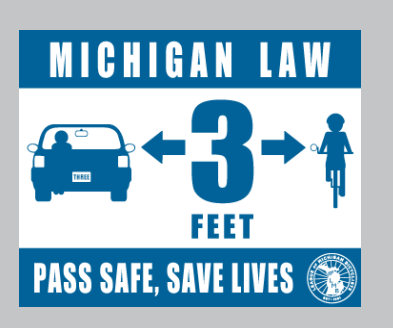
Purchase a Safe Passing yard sign, sticker, or pin to help us spread the word! LMB.org/shop

Autonomous vehicles. We joined the League of American Bicyclists in signing on to a letter opposing the AV START Act in its current form. While autonomous